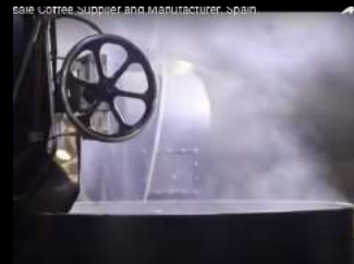
Wholesale Coffee, Wholesale Coffee Supplier and Manufacturer, Spain

Our industrial roasters work with gas and hot air and require extreme expertise to give the best flavour. Hot air will ripen the coffee right in the cell, allowing the beans to ripen more evenly from the inside and retains the characteristic flavor of the coffee