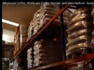
Wholesale Coffee, Wholesale Coffee Supplier and Manufacturer, Spain

Our coffee factory is located in Alicante, Spain, with a 20-year history as roasters and a fully automated packaging system on-site.